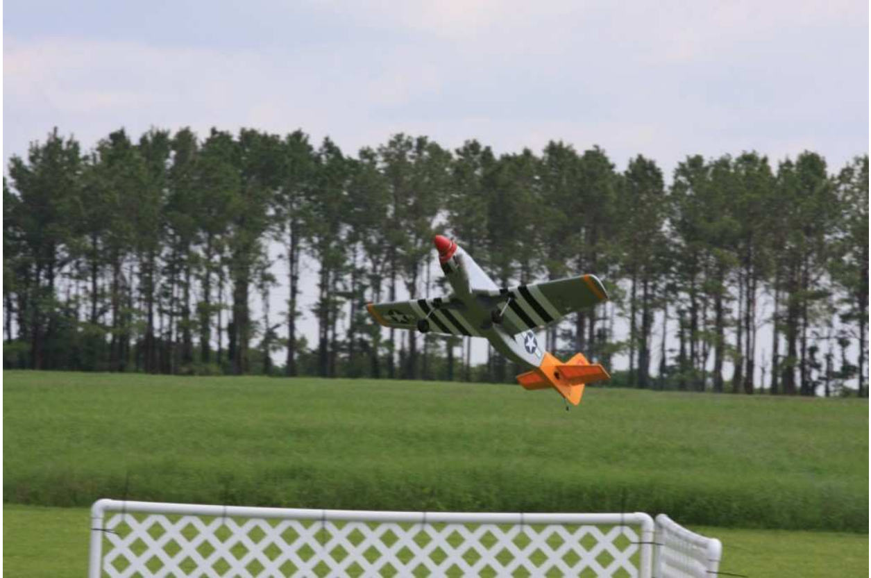
Early rotation + steep climb = no lift = loss of control. Which leads to being in the wrong place ... BTD.